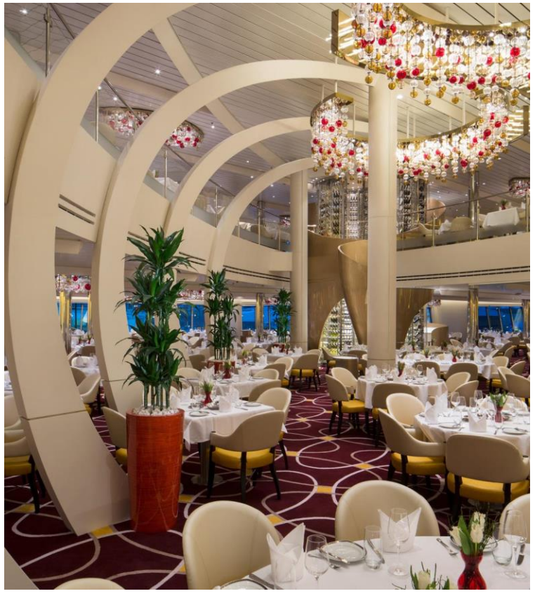
9 Days • 22 Meals: 8 Breakfasts, 7 Lunches, 7 Dinners

HIGHLIGHTS... Vancouver, Inside Passage Northbound, Tracy Arm Inlet, Juneau, Skagway, Glacier Bay, Ketchikan, Inside Passage Southbound