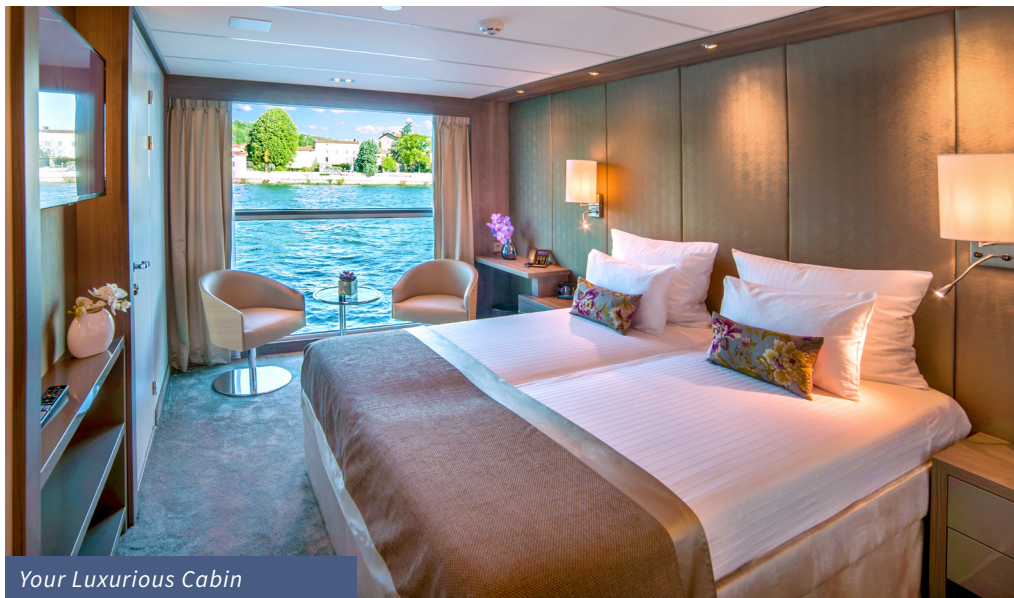
Your Luxurious Cabin

This morning is the included Geneva City Tour. You will enjoy an up close and personal look at this cheerful city with its backdrop of lofty snowcapped peaks. The lakefront and its famous water fountain, the Flower Clock, St. Peter’s Cathedral, Reformation Wall and the Palace