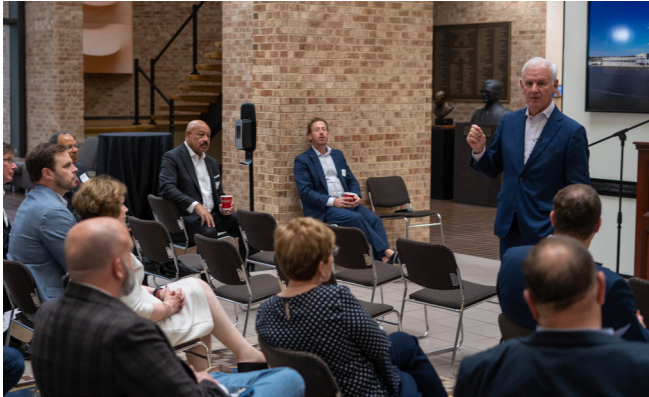
Quarterly Chamber Update

Members of the Board of Advisors receive additional benefits including access to executive-level contacts, company recognition, exclusive updates and invitations to invite-only receptions and events.