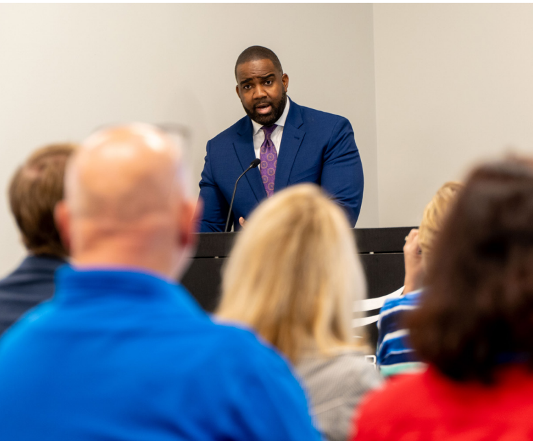
Board of Advisors & Board of Directors Joint Meeting