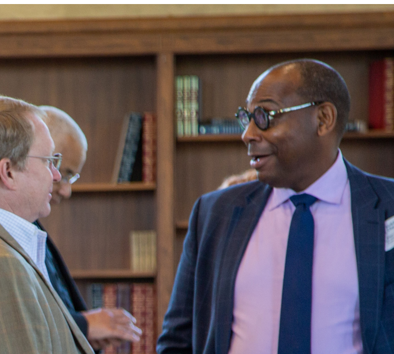
Board of Advisors/Board of Directors Joint Spring Meeting

Receive economic development project announcements and news releases before the general membership or the media