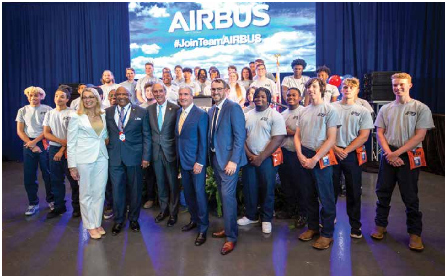
The Airbus announcement was made at Bishop State Community College alongside the latest class of FlightPath9, an ongoing recruiting effort to train and educate local students with the skills needed to work in the Airbus manufacturing facility.

Airbus announced a third final assembly line will be built at the Mobile Aeroplex at Brookley, as the airplane manufacturer ramps up production in Mobile to 20 planes per month.