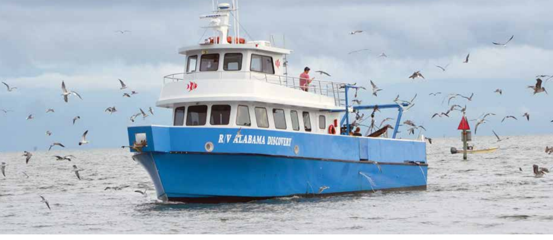
The Dauphin Island Sea Lab's 65-foot boat, ALABAMA DISCOVERY, is one of several in a fleet of vessels that carry scientists, university students and Discovery Hall program participants into Mobile Bay and northern Gulf to conduct research, measure salinity and oxygen, and collect marine animals.

On 32 acres at the eastern end of Dauphin Island is the nationally recognized marine science institution - the Dauphin Island Sea Lab (DISL). Most are likely familiar with its Estuarium, a museum-like display, full of marine life from clown fish to alligators to sea horses.