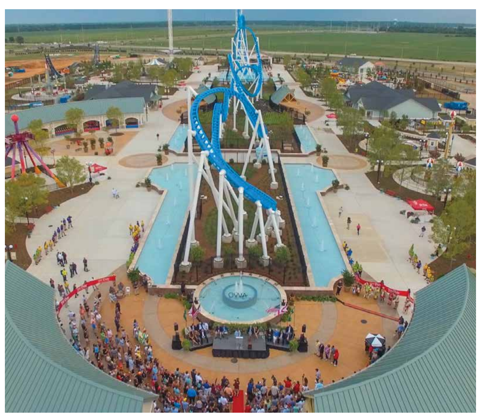
Appropriately, the park's name, OWA, means "big water" in the Muscogee Creek language, the native tongue of the Poarch Band of Creek Indians who own and operate the development. The park contains a 14-acre lake and a splash pad. Construction will begin on a 100,000-square-foot indoor waterpark this summer.