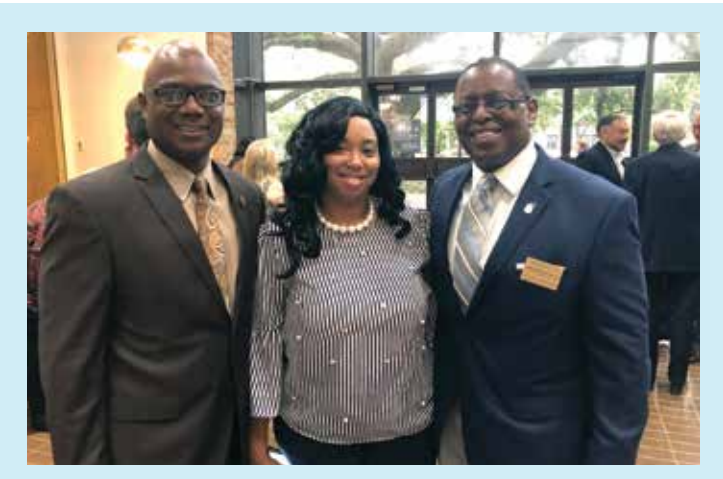
Chamber Chase Begins

Startup Weekend's top three teams were: Toss, which explored the idea of developing eco-friendly shampoo and conditioner single-use pods took first place. Hair RX, the second-place finisher, had a plan to develop a line of wigs and hair extensions. Citrus, the third-place winner, is a program designed to match students with nonprofits for project-based internships.