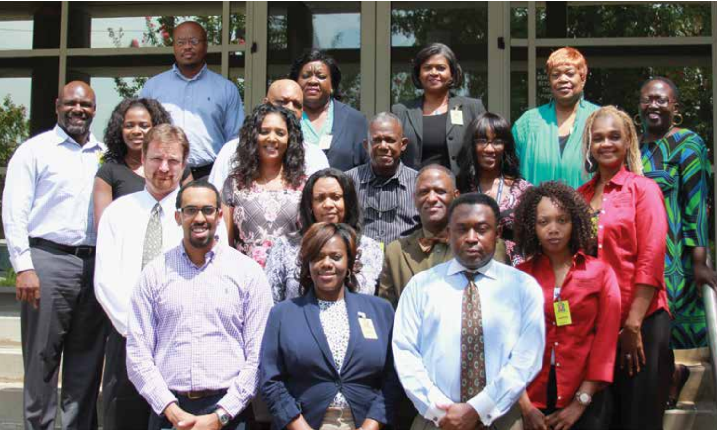
Alabama Department of Transportation (ALDOT) makes a consensus effort to diversify its vendors. The department's Disadvantaged Business Enterprise Unit was recognized with the Mobile Area Chamber's Rev. Wesley A. James Minority Business Advocate Award in 2015. Pictured are ALDOT employees who help with assistance and training for potential vendors looking to do business with the department.