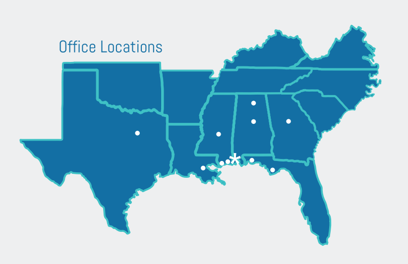
Strengthened by Our Network of Agents Worldwide

*CORPORATE OFFICE 52 N. JACKSON ST | MOBILE, AL 36602 251.287.8700 | PAGEJONES.COM INFO@PAGEJONES.COM