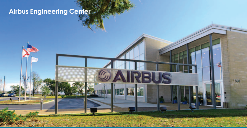
Airbus Engineering Center