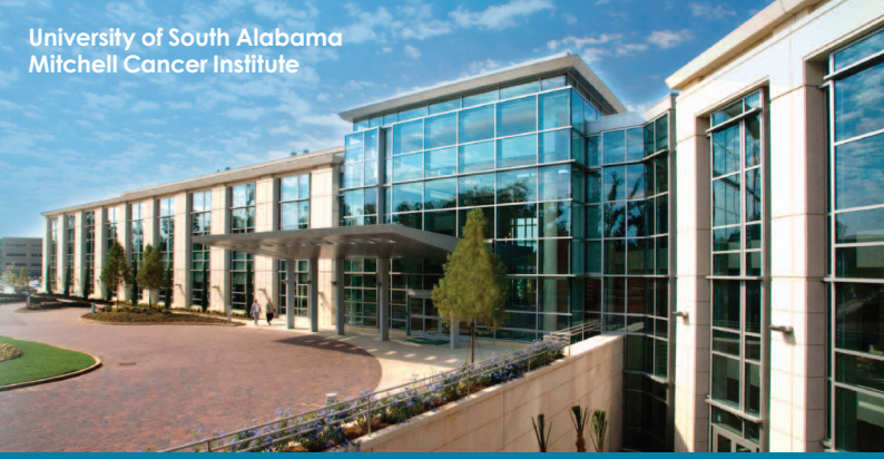
University of South Alabama Mitchell Cancer Institute