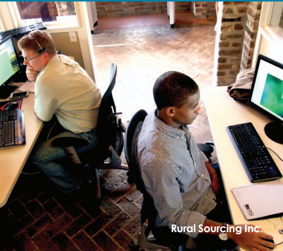
Rural Sourcing Inc.