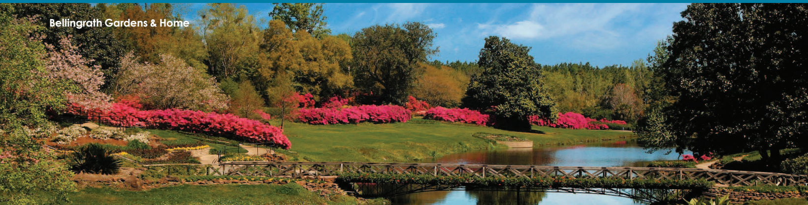
Bellingrath Gardens & Home