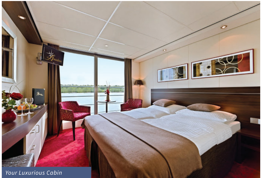
Your Luxurious Cabin

Today you will enjoy a tour of the city of Munich. Admire architectural wonders like the Old Town Hall, St Peter's Church and the Munich Residenz; stroll through the lively Viktualienmarkt; and see the world-famous Hofbräuhaus beer hall. Accompanied by an expert guide, you'll have ample opportunities to learn more about Munich's history, cultural heritage and beer-