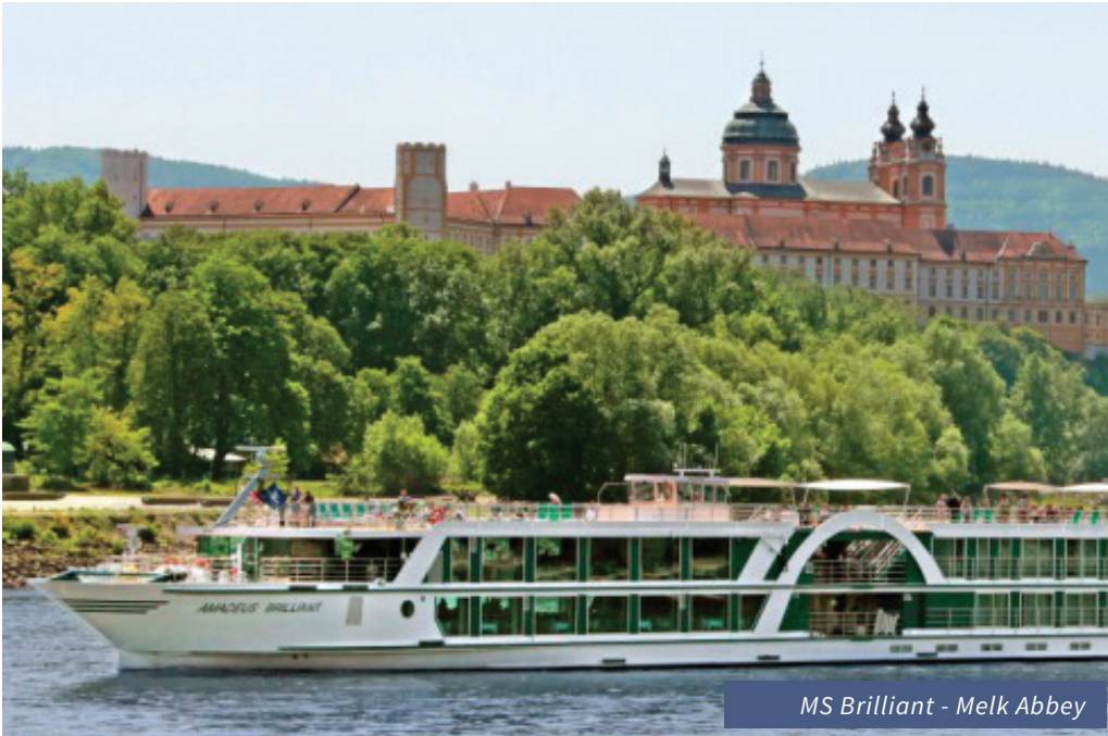
MS Brilliant - Melk Abbey

After disembarking, we will travel to Munich, Germany for your flight home, taking with you warm memories of new places and friends. (B)